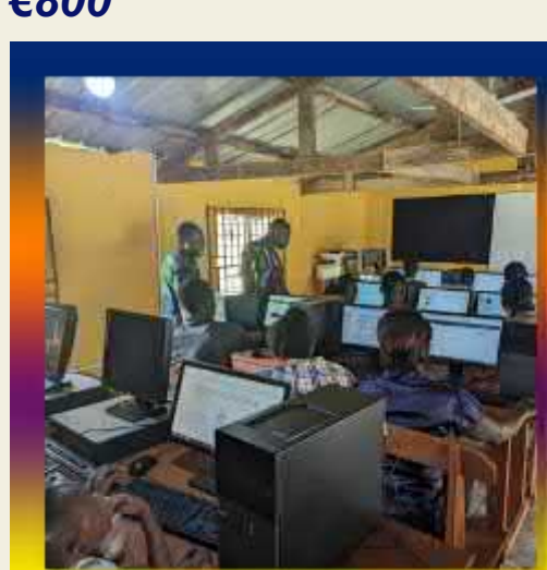
Costs of a 1 year teachers training, weekly €12,50