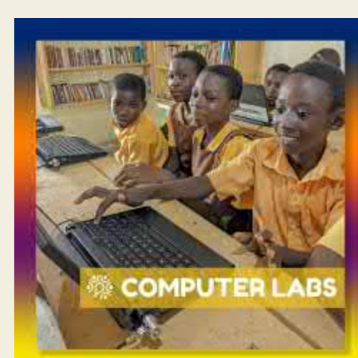
Cost of a computer €300