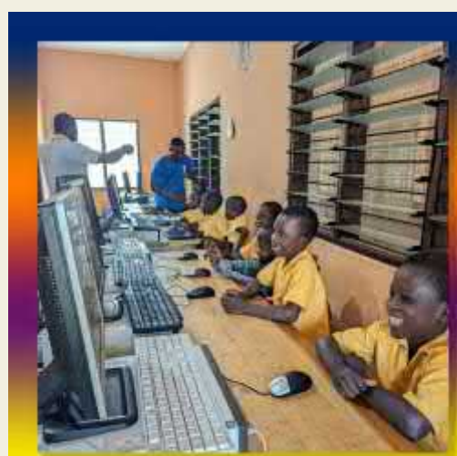
Cost of a bench €50 and a table €75