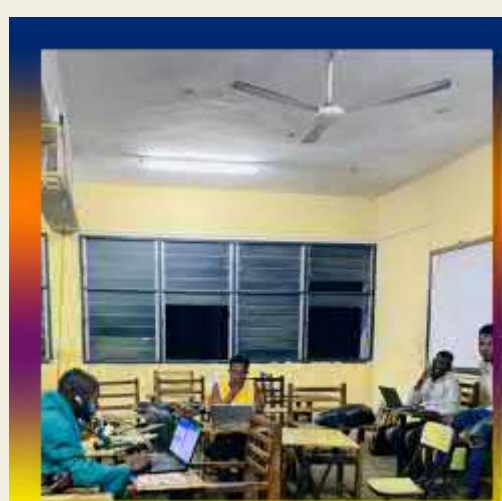
Costs of a fan €50